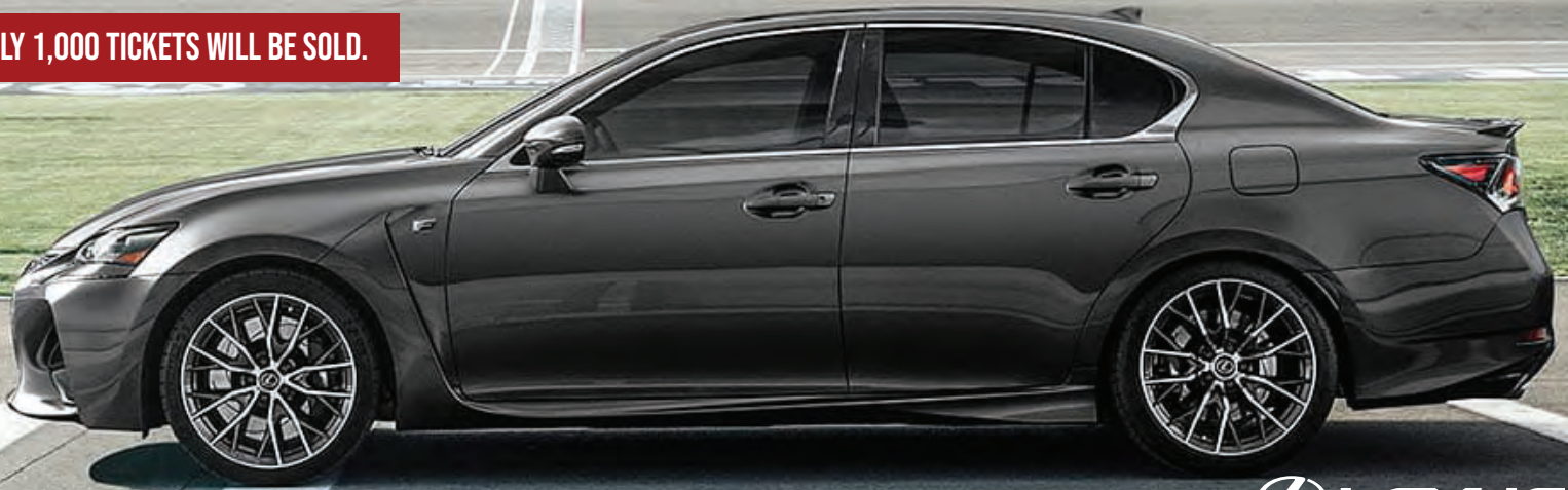
ACTUAL VEHICLE COLOR MAY DIFFER FROM PHOTO.